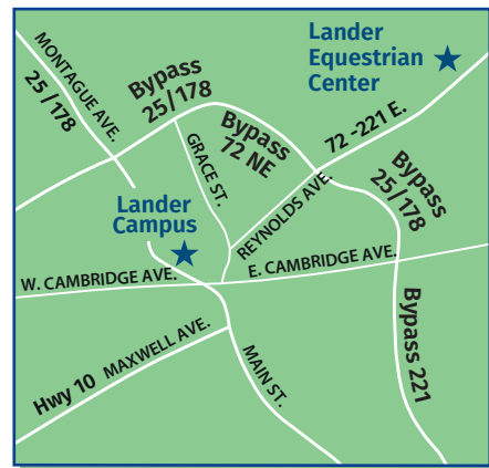
Lander Equestrian Center (2611 Hwy. 72-221 East)