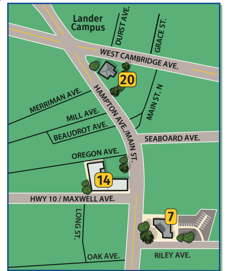
Alumni Association & Lander Foundation (The Greenwood Building, 104 Maxwell Ave., 6th Floor) Lander Uptown Building (323 Main St.)

To Uptown Greenwood Alumni Association & Lander Foundation